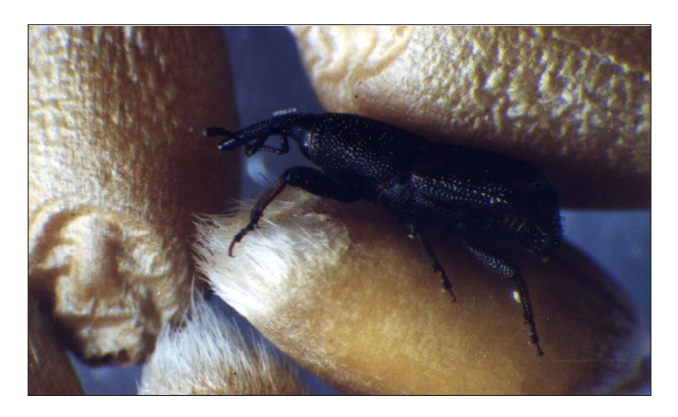
Figure 1 Sitophilus zeamais on seeds of corn.